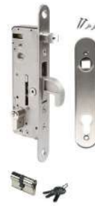
Lock & cylinder