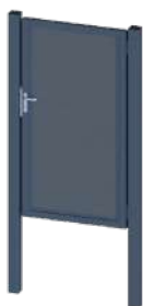
single swing gate